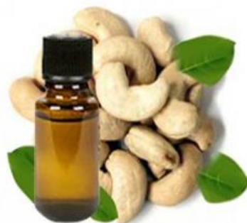
Flate 1.2: Cashew nut Oil